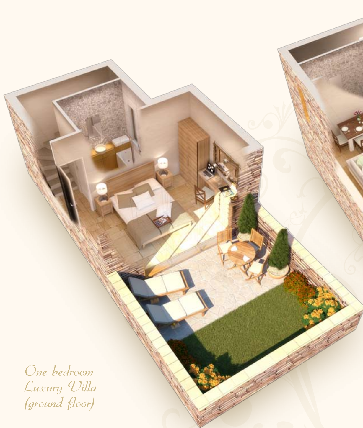
One bedroom Luxury Villa (ground floor)