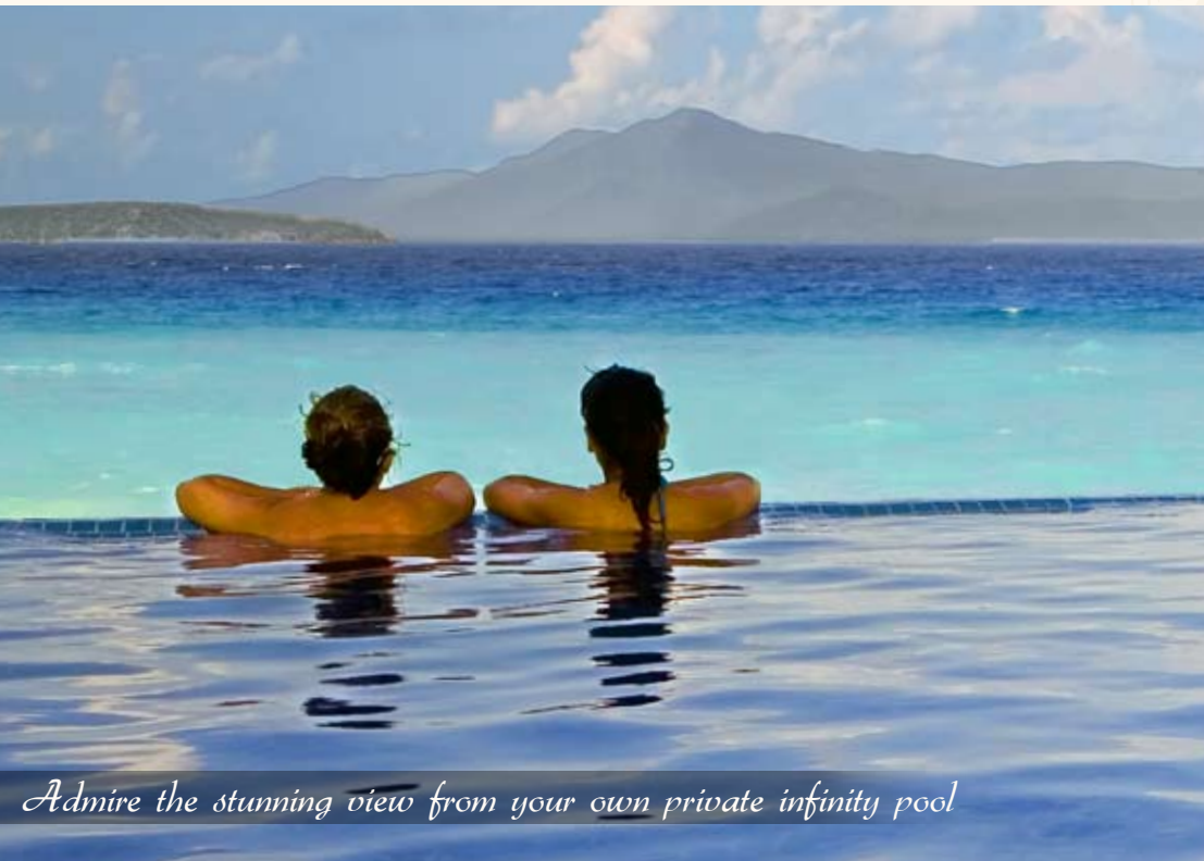
Admire the stunning view from your own private infinity pool