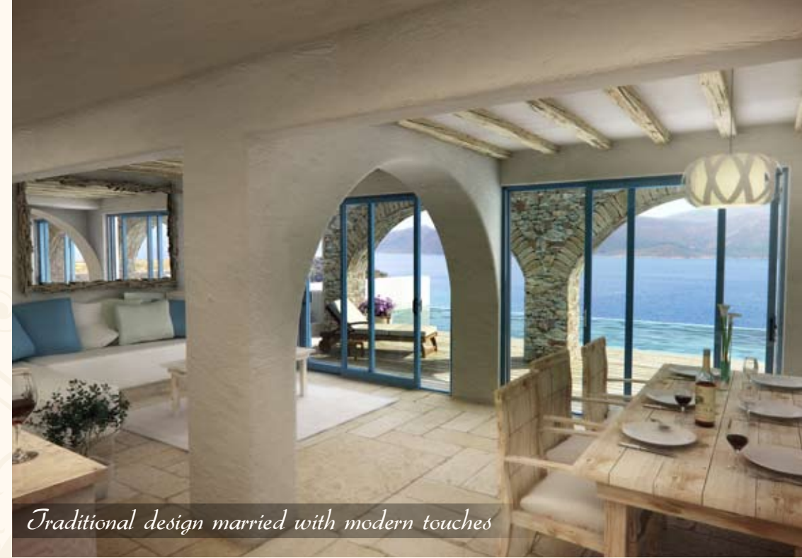
Traditional design married with modern touches

The Halcyon Hills three bedroom premier villas represent the pinnacle of five star property ownership. Each villa will encompass classic Greek living with modern touches. Complete with their own private pools and garden areas, the accommodation will be spacious and opulent. The villas are situated in the prime locations throughout the resort, taking full advantage of the outstanding ocean views.