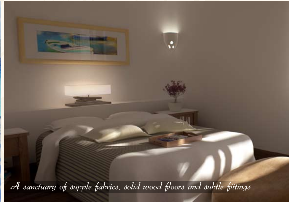
A sanctuary of supple fabrics, solid wood floors and subtle fittings