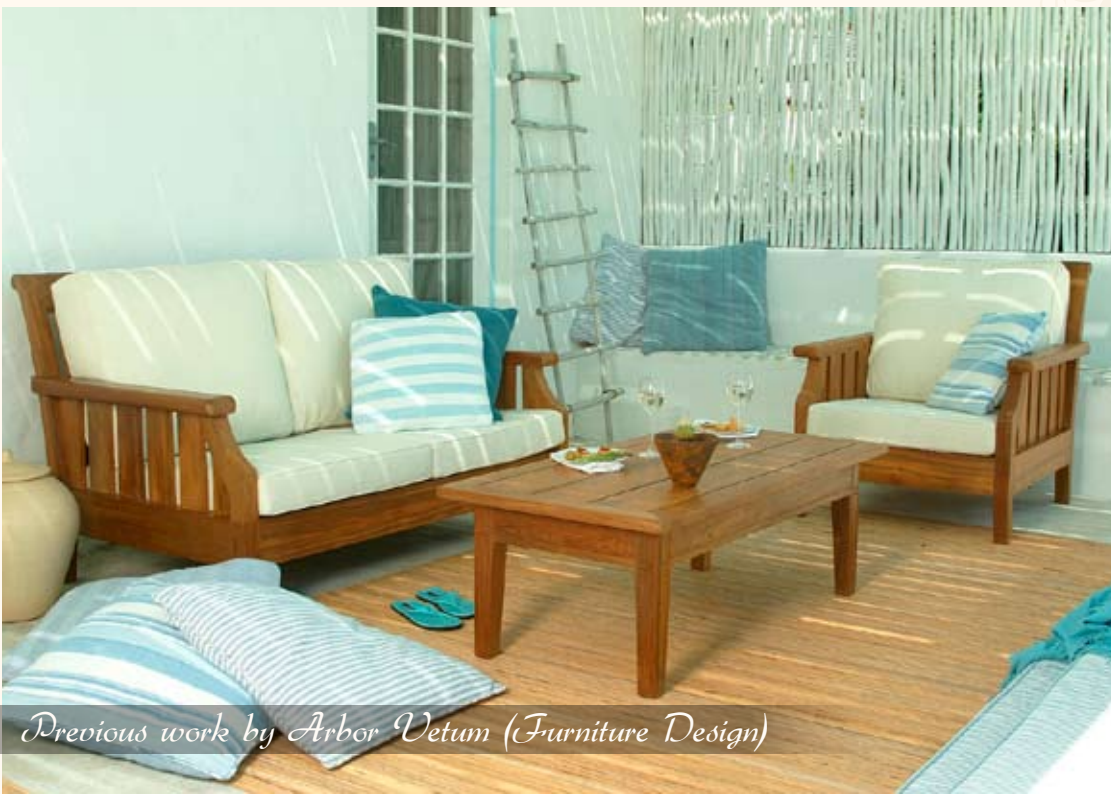
Previous work by Arbor Vetum (Furniture Design)