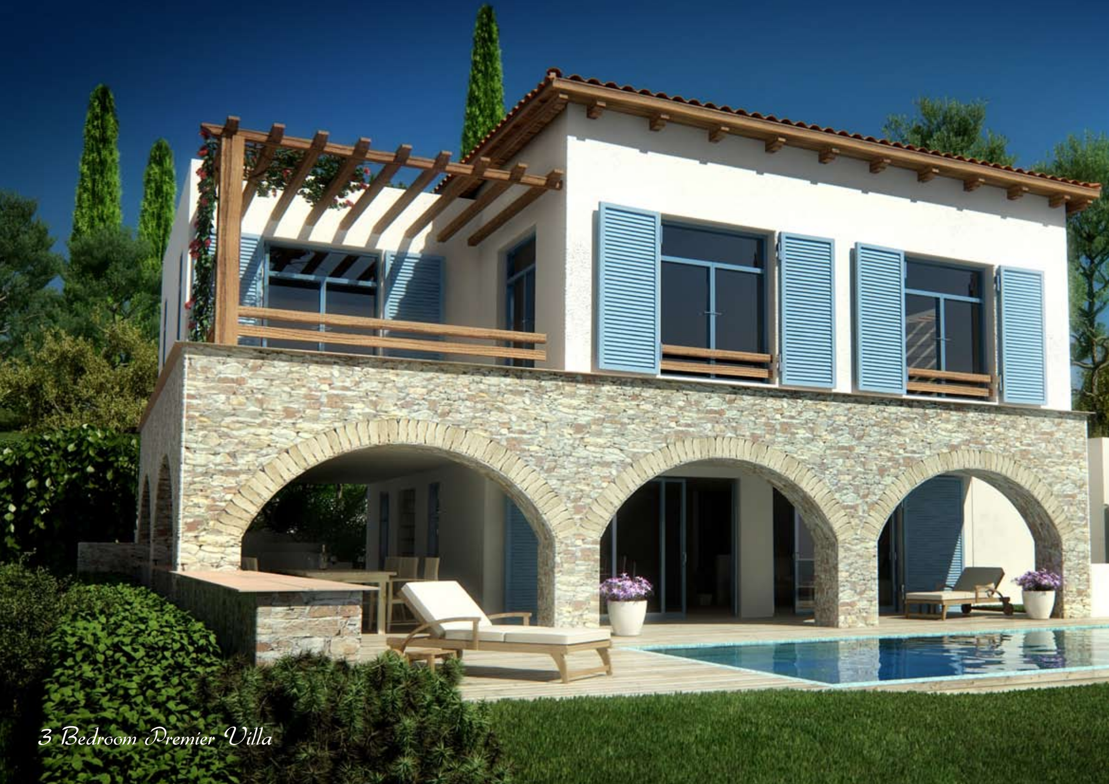
3 Bedroom Premier Villa