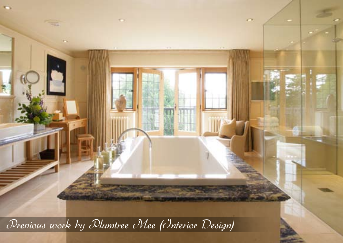
Previous work by Plumtree Mee (Interior Design)