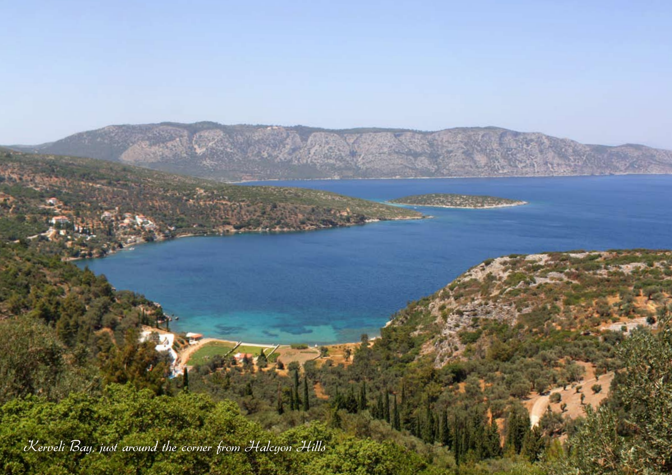
Kervoeli Bay, just around the corner from Halcyon Hills