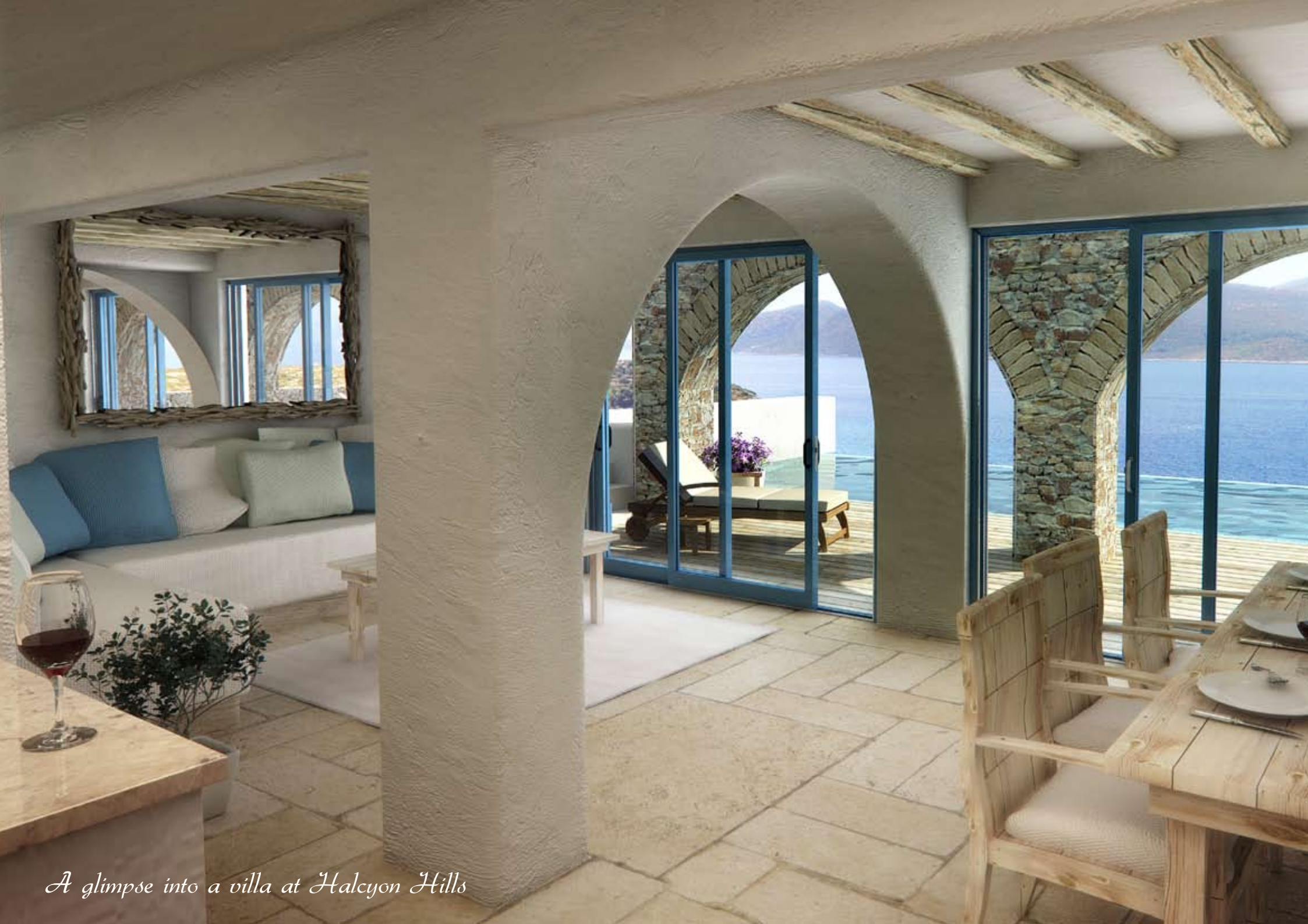
A glimpse into a villa at Halcyon Hills