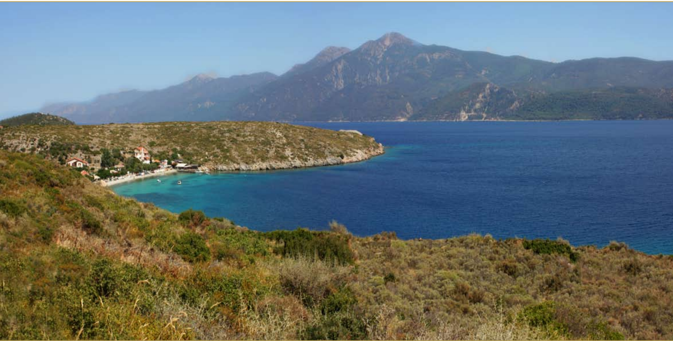
Actual plot of Halcyon Hills (above)