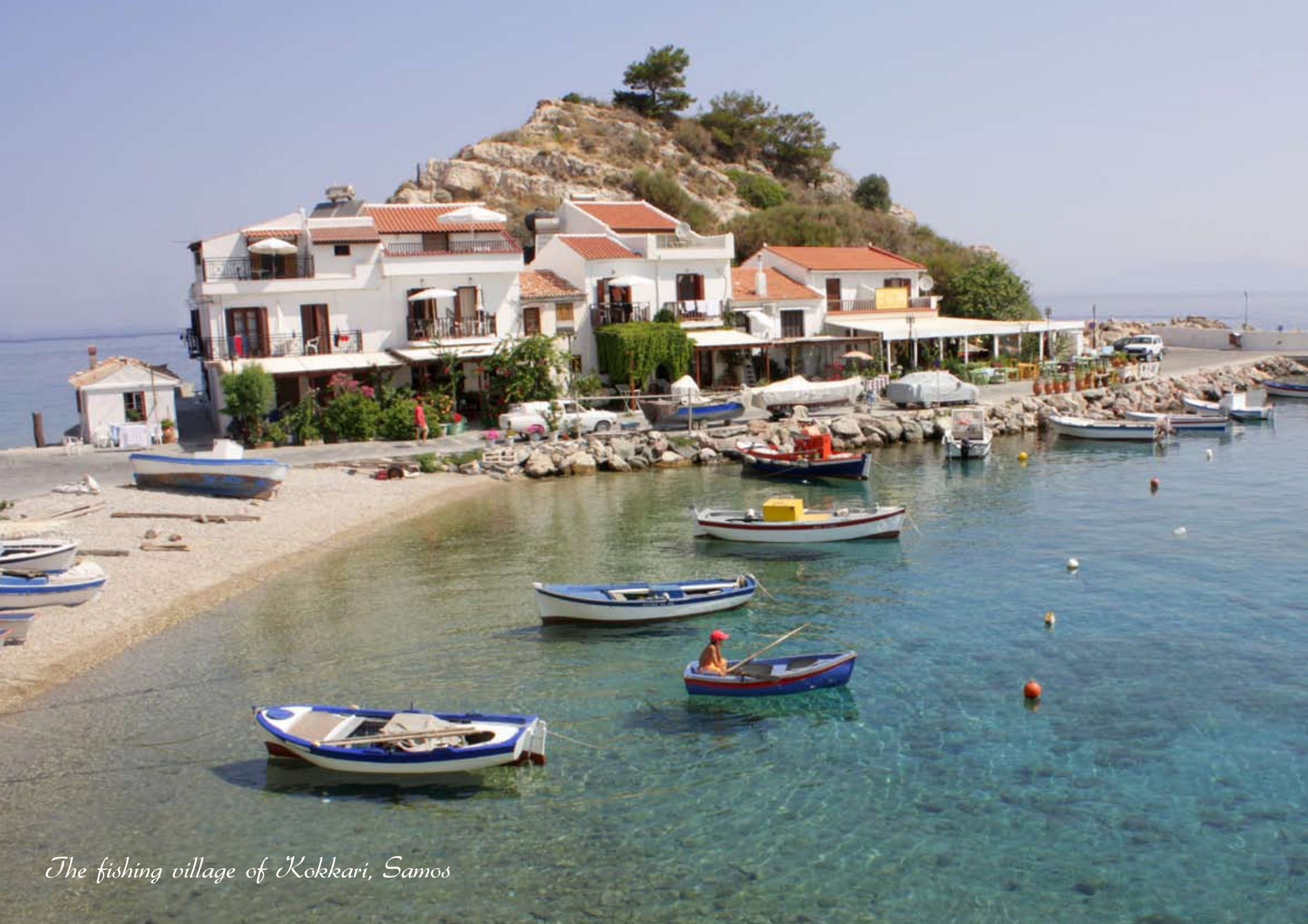
The fishing village of Kokkari, Samos